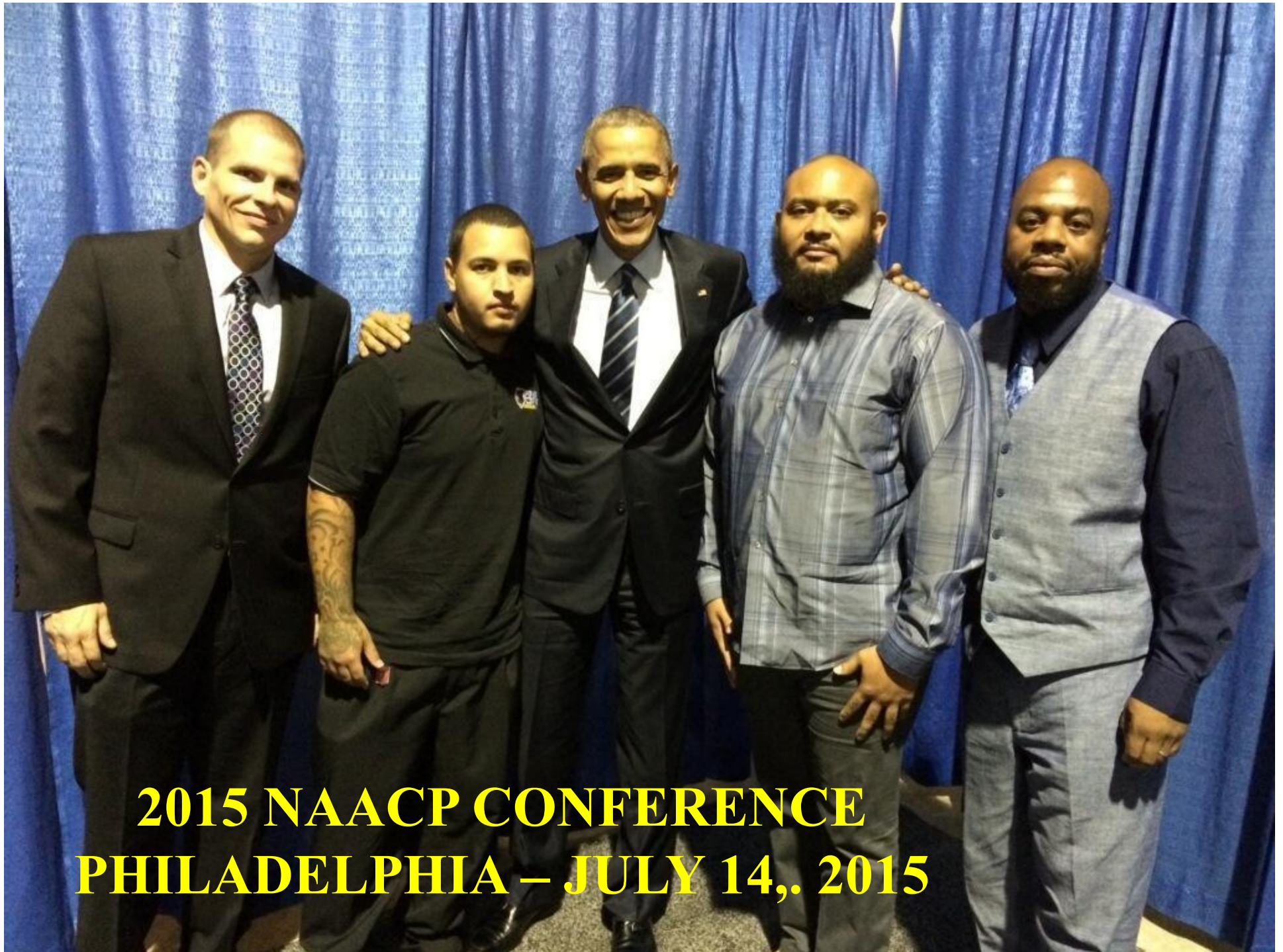
2015 NAACP CONFERENCE PHILADELPHIA – JULY 14,. 2015